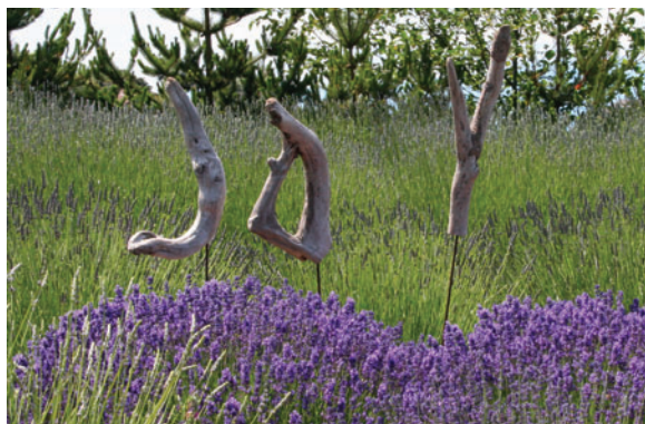
Lavender Wind Farm

Open daylight hours year round A historic farm family. Grass-fed beef cuts (USDA inspected), free-range eggs, flowers, corn, pumpkins, squash.