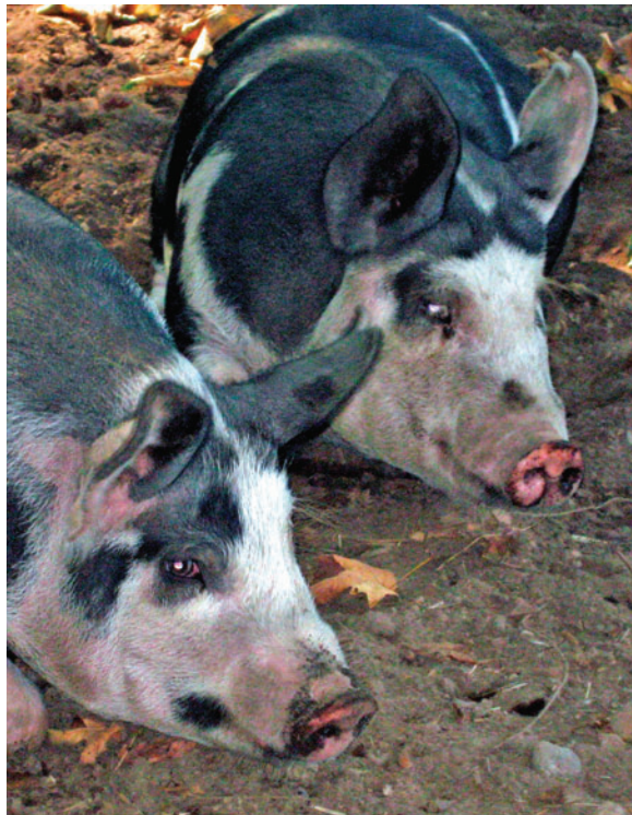
Quail's Run Farm

Locally grown grass and alfalfa/grass hay, seasonal sweet corn, wheat and barley for livestock feed. Call for product availability and prices.